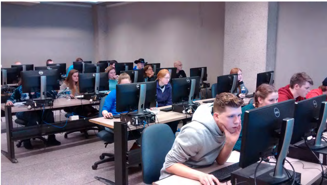
Fig. 1 Students working on the LHCb masterclass activity at Syracuse Univ. computing lab.

In March, the Syracuse University group was pleased to host two days of LHCb MasterClasses, which enabled about 50 high school students from four different schools to learn about particle physics and the Large Hadron Collider. The four high schools were: Cicero-North Syracuse, Vernon-Verona-Sherrill, Weedsport, and Fayetteville Manlius. Students spent the morning attending presentations by Profs. Steven Blusk and Matthew Rudolph on particle physics and the LHC, and working on an activity using LHCb data in the afternoon (see Fig 1 below). Feedback from teachers indicated the students enjoyed the day's events.