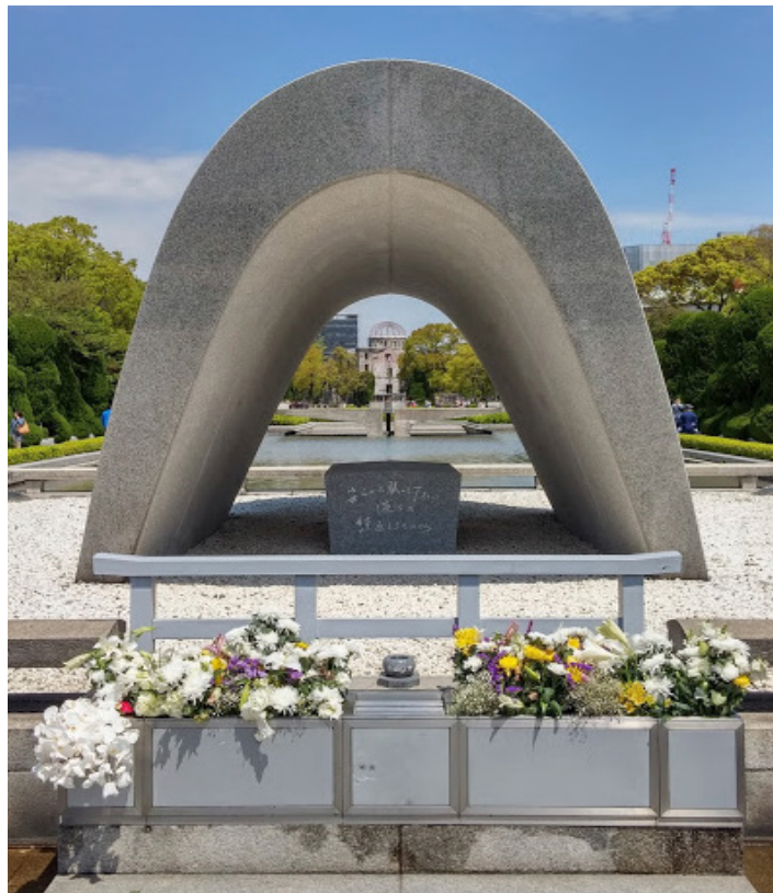
Hiroshima Cenotaph

UN Secretary-General Boutros Boutros-Ghali at the opening of the Nuclear Non-Proliferation Treaty Review and Extension Conference at the UN in New York, 17 April 1995