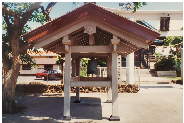
Hiroshima Peace Bell, Honolulu, Hawai'i.

nations (U.S., Russia, United Kingdom, France, and China) have not fulfilled their Non-Proliferation Treaty commitments to ban nuclear testing and to pursue negotiations on nuclear disarmament. The Non-Proliferation Treaty Review and Extension Conference in April-May 1995 reached a consensus to extend the Non-Proliferation Treaty indefinitely. The nations at the conference also adopted a statement of Principles and Objectives for Nuclear Non-Proliferation and Disarmament, which calls for "completion by the Conference on Disarmament of the negotiations on a universal and internationally and effectively verifiable Comprehensive Nuclear-Test-Ban Treaty no later than 1996" and for "determined pursuit by the nuclear-weapon states of systematic and progressive efforts to reduce nuclear weapons globally, with the ultimate goal of eliminating those weapons."