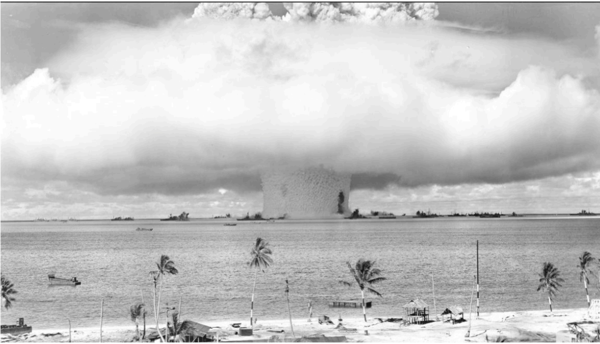
Baker underwater nuclear weapon test by the United States military at Bikini Atoll, Micronesia, on 25 July 1946.

In the afternoon something began falling from the sky upon our island. It looked like ash from a fire. It fell on me, it fell on my wife, it fell on our infant son. It fell on the trees, and on the roofs of our houses. It fell on the reef, and into the lagoon.... We were very curious about this ash falling from the sky. Some people put it in their mouths and tasted it. One man rubbed it into his eye to see if it would cure an old ailment. People walked in it, and children played with it. Later on, in the early evening it rained. The rain fell on the roofs of our houses. It washed away the ash. The water mixed with the ash which fell into our water catchments. Men, women and children drank that water. It didn't taste like rainwater and it was dark yellow, sometimes black. But people drank it anyway. Then, the next day, some Americans came to our island. They had a machine (Geiger counter) with them. They went around the island. They looked very worried and talked rapidly to each other. They told us we must not drink the water in our catchment tanks. They left—without explaining anything. By now most of the people were sick. Many vomited and felt weak. Later, the hair of men, women and children began to fall out. A lot of people had burns on their skin. On the third day some ships came to our island. They explained that we were in great danger because of the ash. They said, "If you don't leave, you will die."