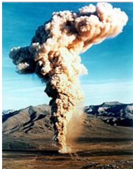
Baneberry test on 18 December 1950 that was not contained as intended.

The General Advisory Committee, headed by J. Robert Oppenheimer, recommended against an "all-out" effort. Other scientists, notably Edward Teller, and Atomic Energy Commission member Lewis Strauss argued for the H-bomb, which the Air Force wanted for the Strategic Air Command. President Truman's decision to approve the H-bomb effort came just four days after the arrest of Klaus Fuchs, who had passed bomb secrets to the Soviet Union.