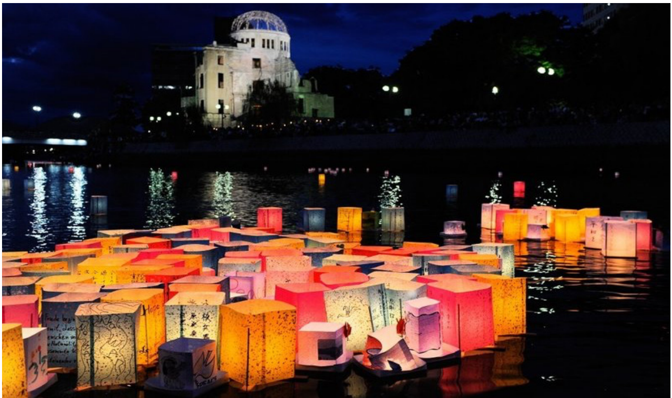
Paper lanterns to commemorate the victims of the bombing of Hiroshima float in the Motoyasu River in front of the Atomic Bomb Dome, in Hiroshima, Japan.