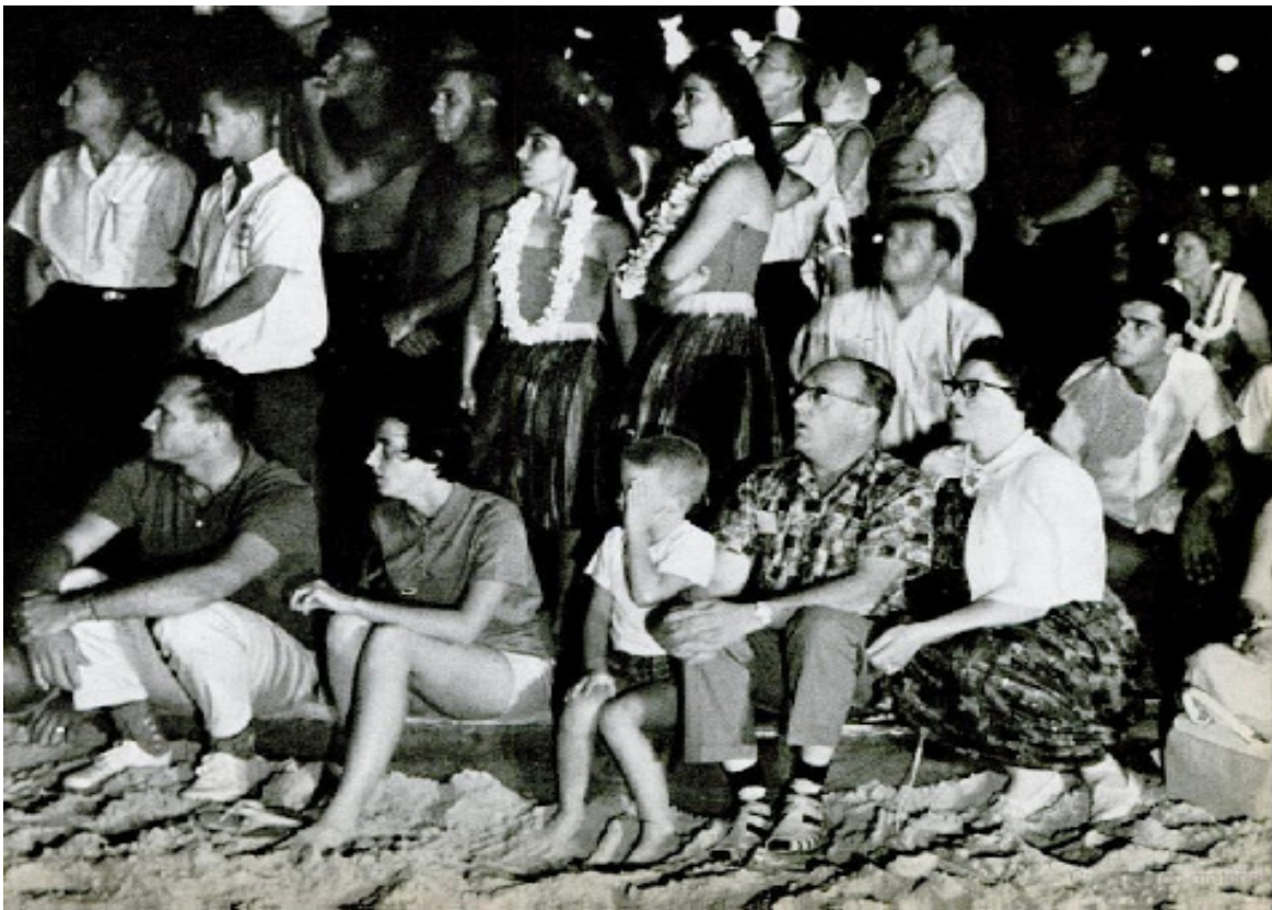
Eight hundred miles away high above Johnston Island, the nuclear explosion lights the sky near the Hawaiian Islands as spectators in Waikiki watch. Life Magazine, 20 July 1962 issue.

One of the consequences of the Limited Test Ban Treaty affecting Hawai'i is an obscure U.S. program known as Safeguard C. This program was mandated by Congress to maintain support facilities in the Pacific so that atmospheric nuclear testing could quickly resume if necessary. The Kaua'i Test Facility at the Pacific Missile Range Facility on Kaua'i was set up under Safeguard C to provide capability to launch sensors to monitor atmospheric nuclear tests. The Kaua'i Test Facility is now used to launch "Star Wars" experiments.