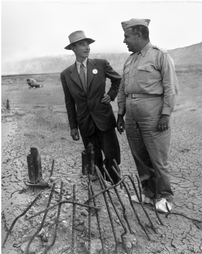
J. Robert Oppenheimer, Director of the Los Alamos Atomic Bomb Project with Major General Leslie R. Groves, Chief of the Manhattan Project. War and Peace in the Nuclear Age (PBS documentary).

The first test of the plutonium A-bomb took place while Truman, Churchill, and Stalin were meeting at Potsdam. The site was an area on the Alamogordo Bombing Range in southern New Mexico known as the Jornada del Muerto—Journey of Death. This name had been given to this region by the conquistadores. J. Robert Oppenheimer, the physicist leading the Manhattan Project, was inspired by a John Donne sonnet he had recently read to name the site and the test Trinity. The desert sand fused by the heat of the explosion became known as “trinitite.”