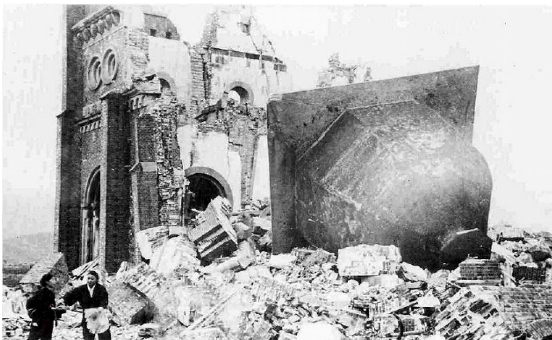
The atomic bomb (Fat Man) fell on Nagasaki on 9 August 1945 and completely destroyed Urakami Cathedral. 7 January 1946.

Quotes from four Hiroshima hibakusha from Nuclear Survivors in Hawaii, A Collection of Oral Histories, Friends of Hibakusha, Hawai'i, 1984