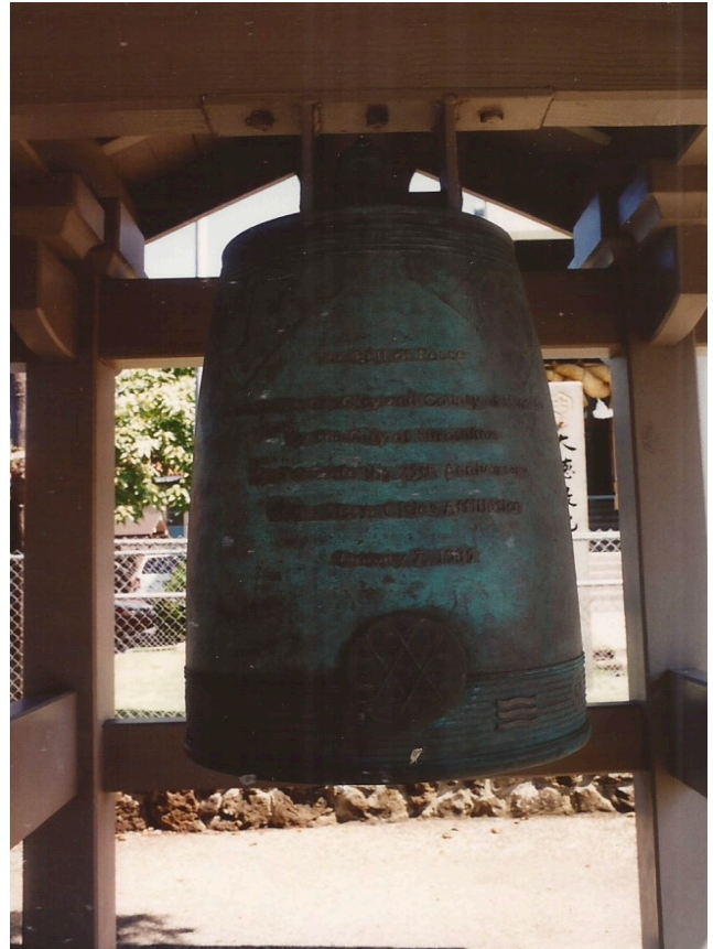
Nagasaki and Hiroshima Peace Bells in Honolulu, Hawai'i