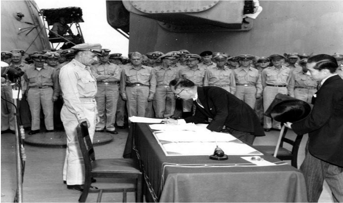
Douglas MacArthur watches as Japanese Foreign Minister Mamoru Shigemitsu signs the surrender document ending World War II on the deck of the USS Missouri, 2 September 1945.

After Biak the enemy withdrew to deep caverns. Rooting them out became a bloody business which reached its ultimate horrors in the last months of the war. You think of the lives which would have been lost in an invasion of Japan's home islands—a staggering number of Americans but millions more of Japanese—and you thank God for the atomic bomb.